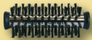
Small for short hair